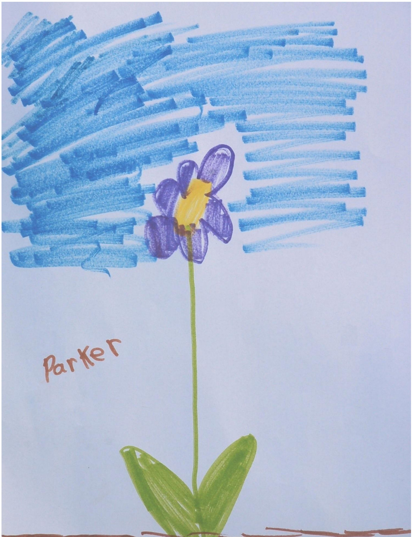
By Parker (Discovery)