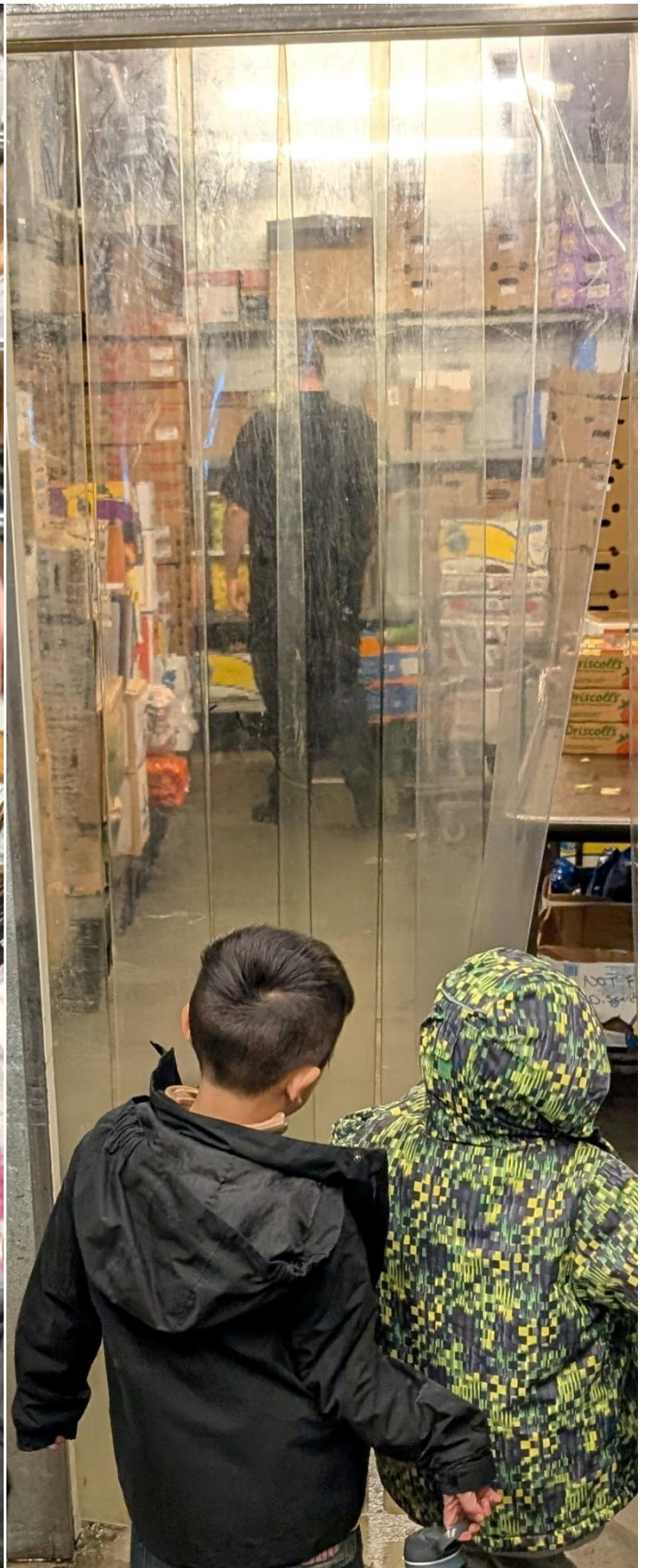
Safeway tour includes fresh cookies and cold storage.