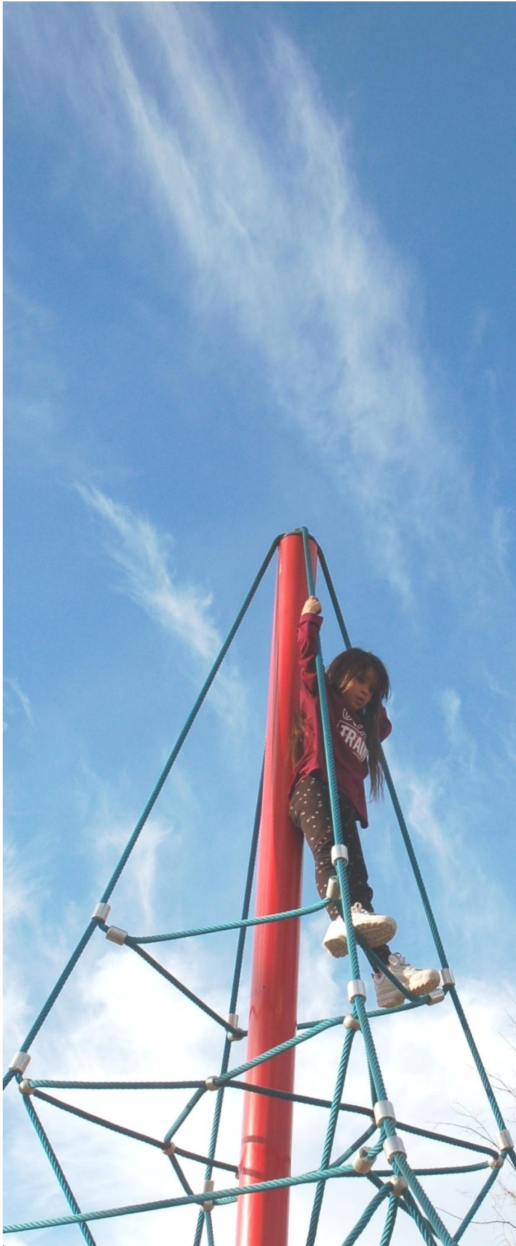
Azariah (Voyagers): sky high.