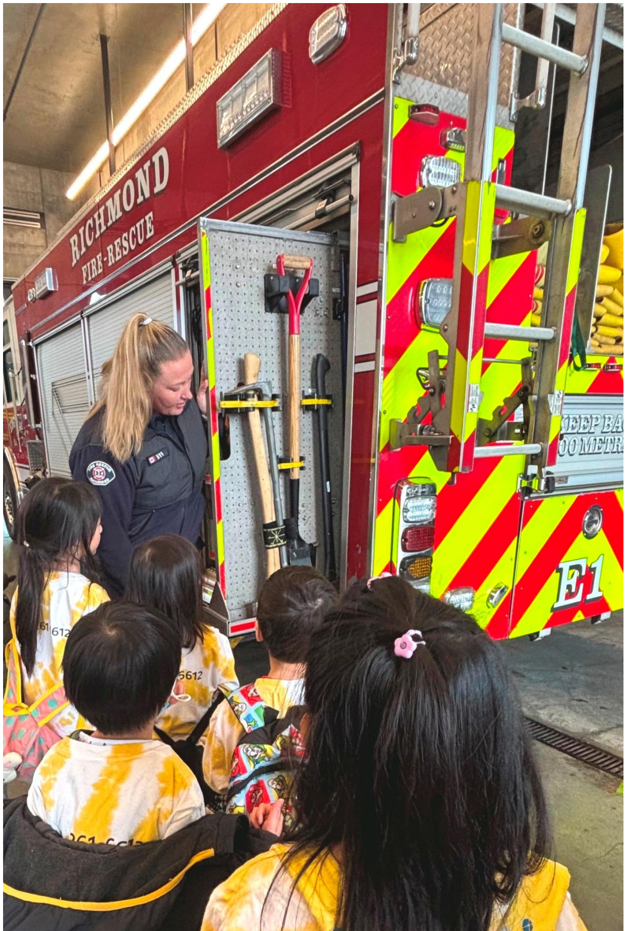
Richmond Brighthouse Fire Hall tour includes fire-rescue truck tools.