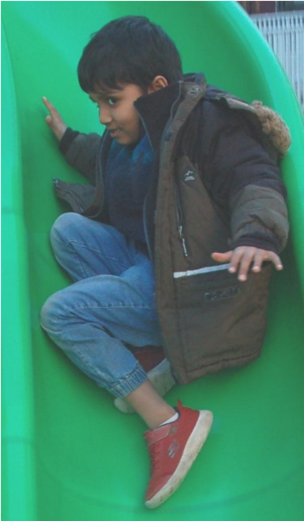
Sadew (Discovery): down to earth.