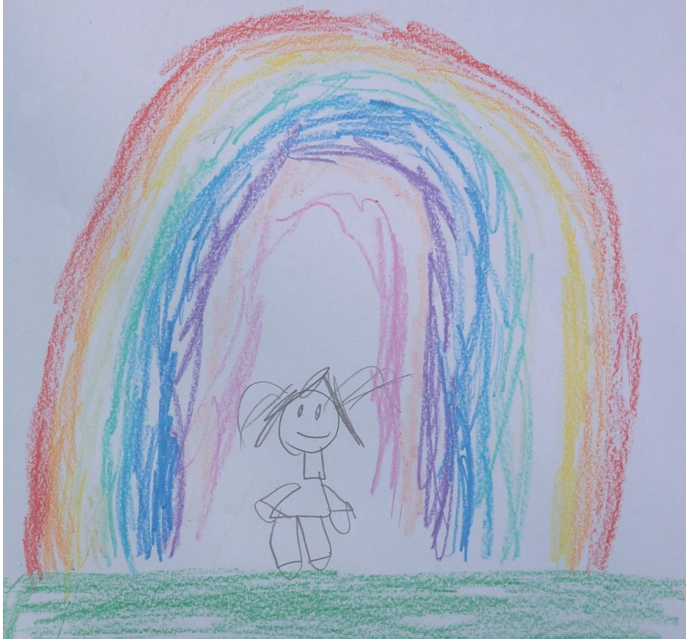
By Arabelle (Discovery)