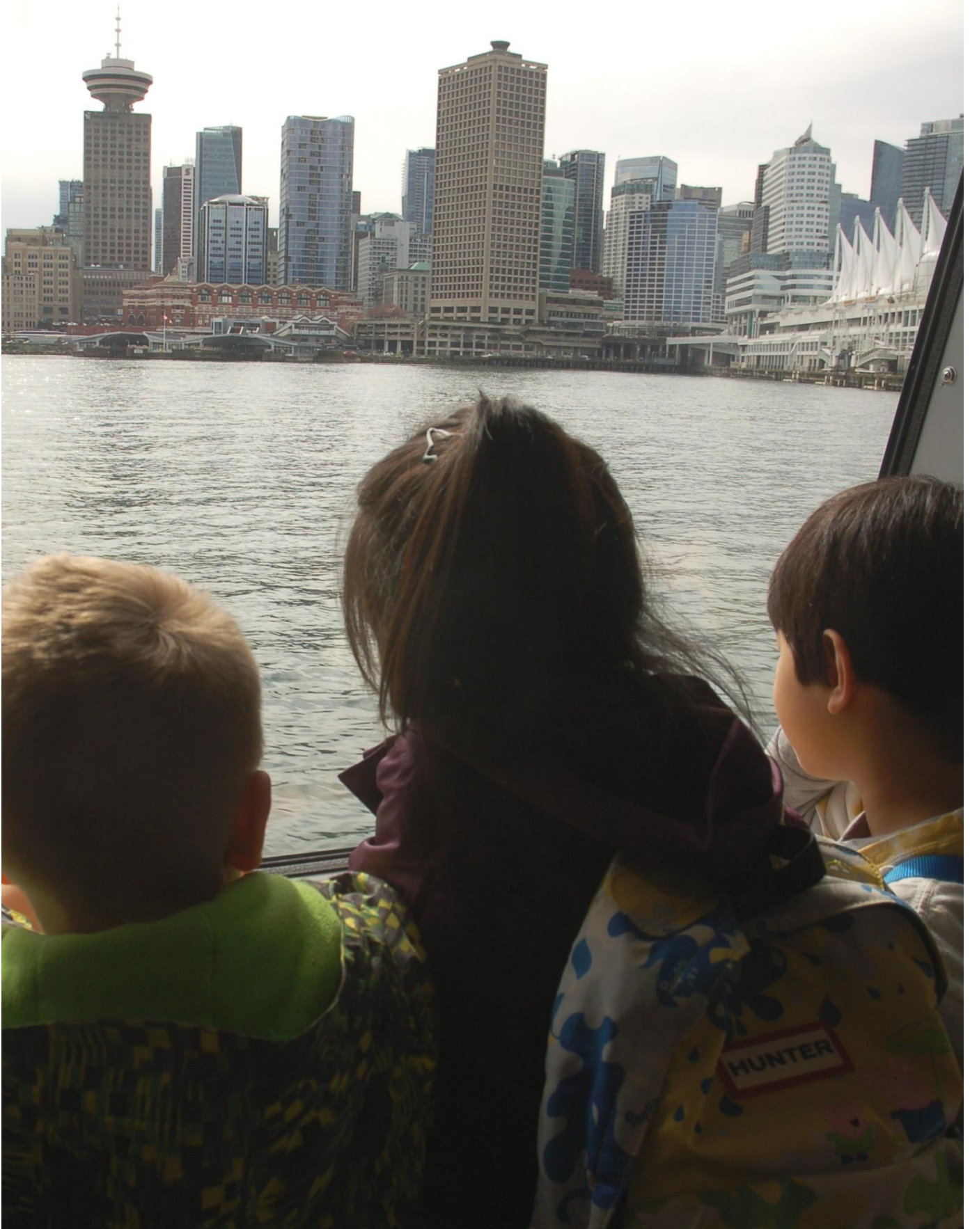
Front row SeaBus seats are perfect for Vancouver view.