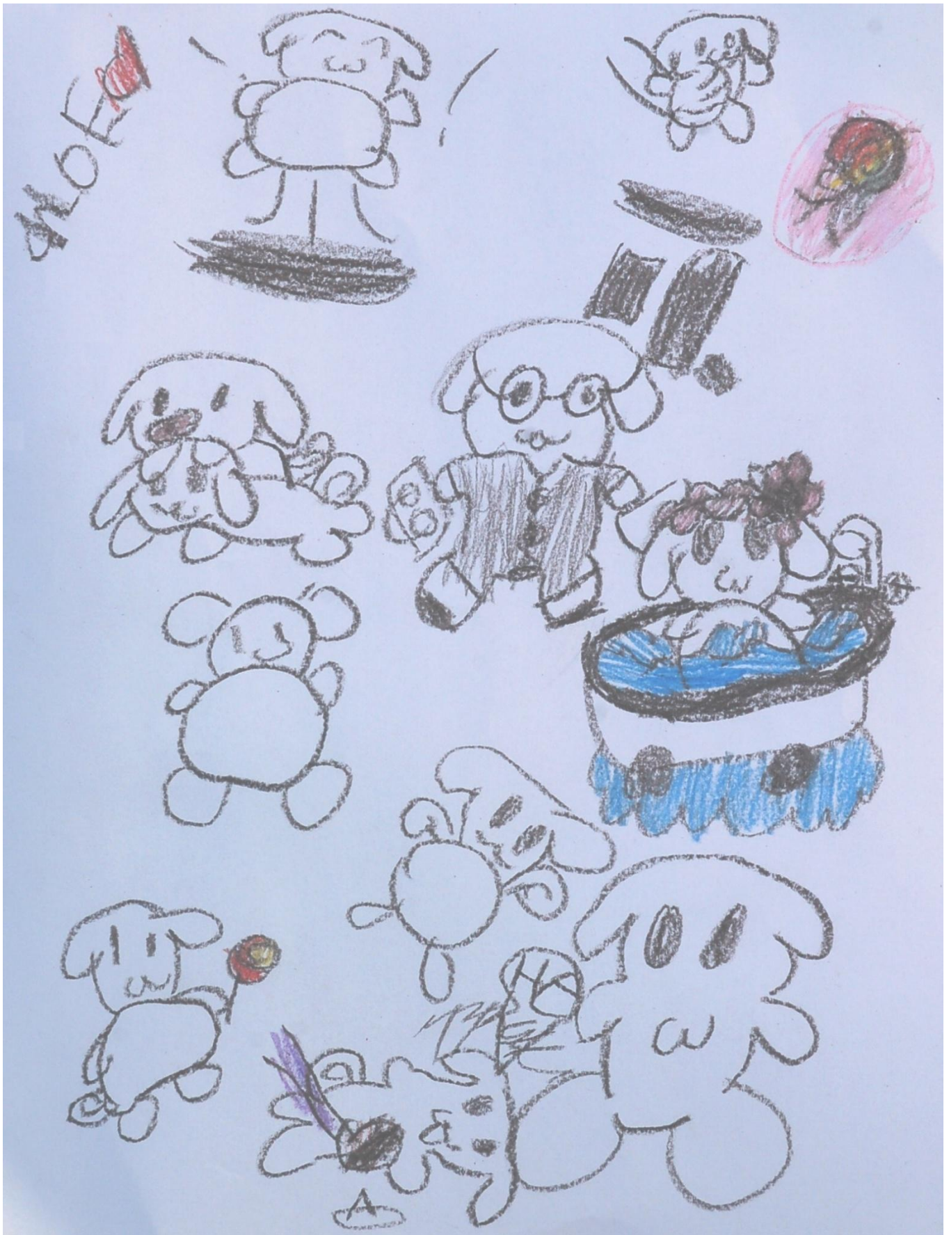
By Chloe (Discovery)