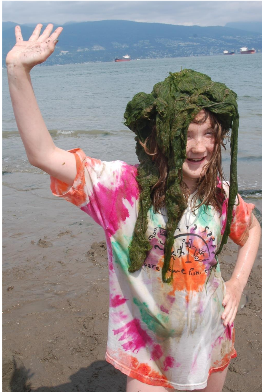
...fashion a green seaweed wig at the beach...